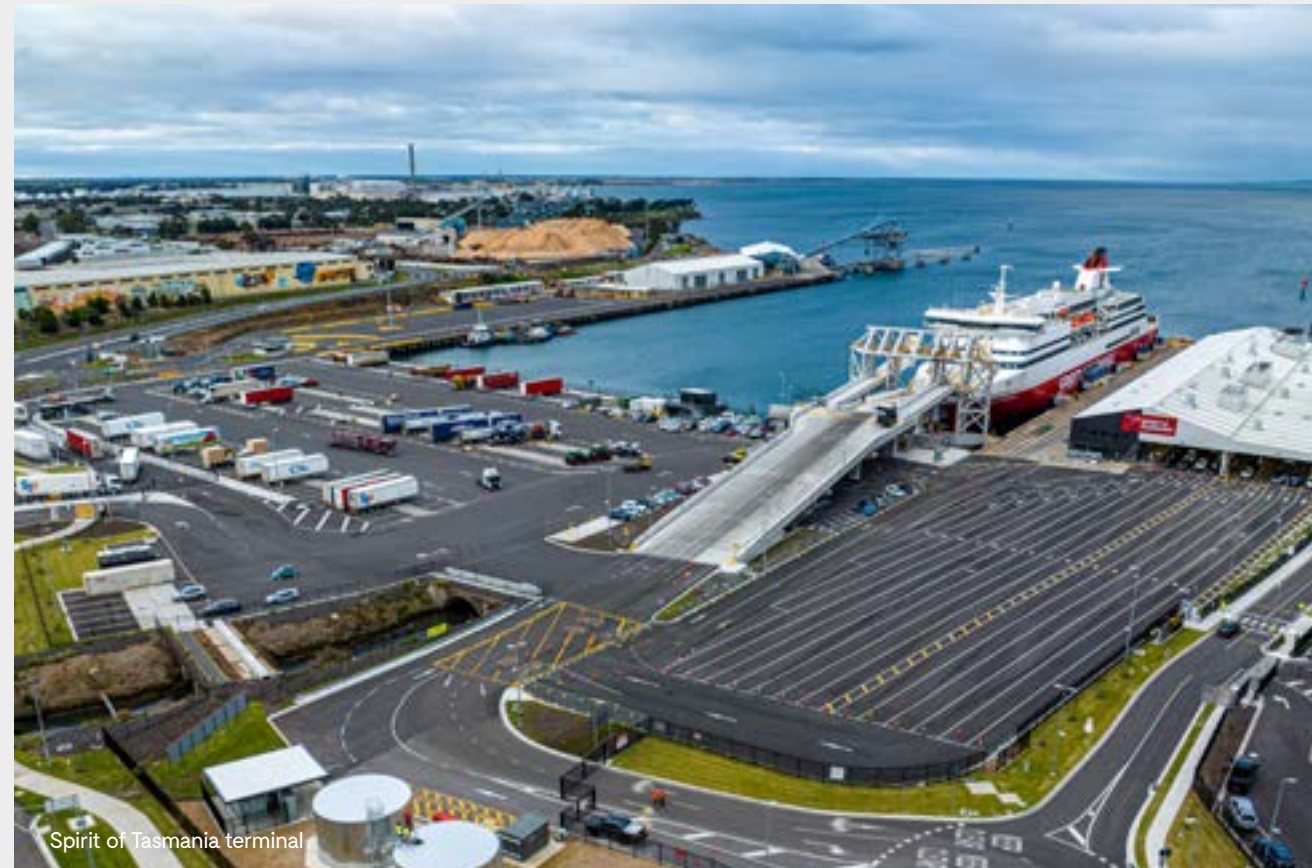
Spirit of Tasmania terminal

Located less than an hour south-west of Melbourne, the Greater Geelong region is one of the most important contributors to the Victorian State economy.