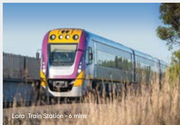
Lara Train Station – 6 mins