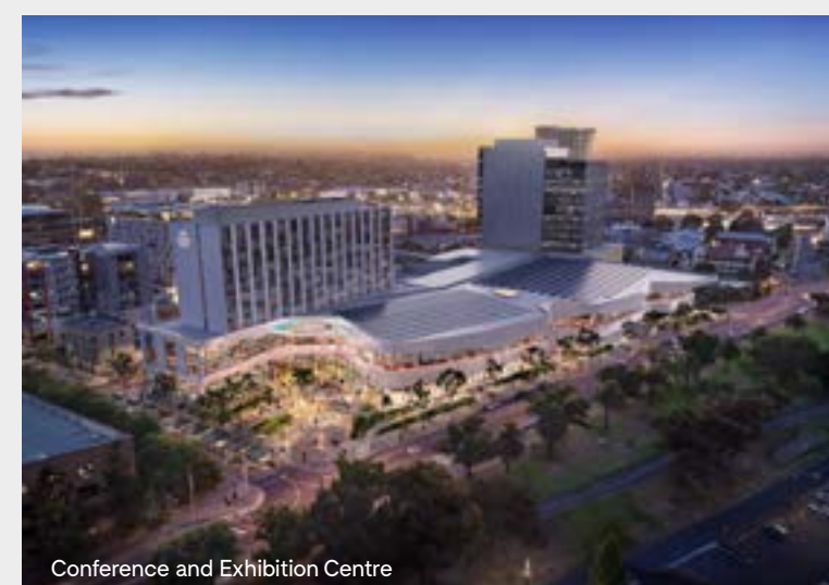
Conference and Exhibition Centre