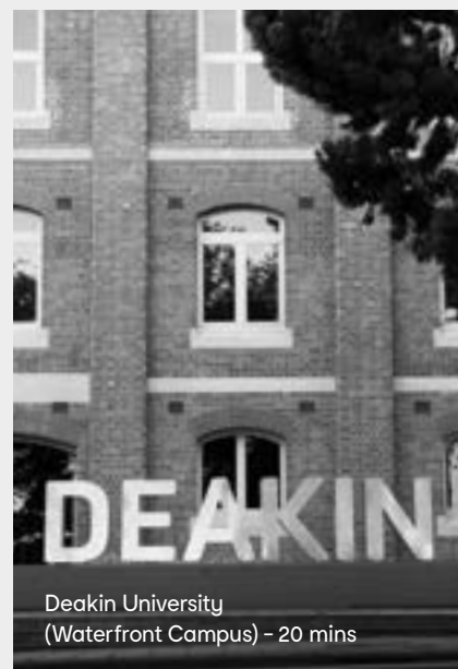
Deakin University (Waterfront Campus) – 20 mins