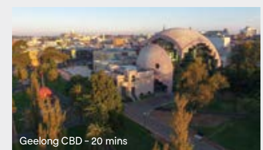
Geelong CBD – 20 mins